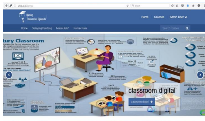
Figure 1. Display of one online course process

The BLM is a learning model that combines face-to-face and online learning [5][6]. BLM provides an alternative learning model that can improve the quality of learning in universities [7]. BLM benefits as a model that can give the students learning experience and independence to achieve the expected competencies [8].